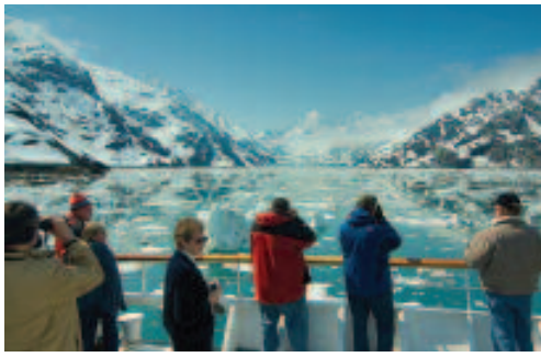
Admire Alaska's magnificent mountainous landscape, a backdrop to stunning glacial silt-colored waters.