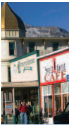
itory, still echoes with the