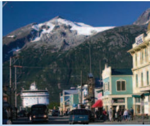
Skagway's historic downtown, gateway to the Yukon Territory, captures the excitement of Alaska's Gold Rush days.