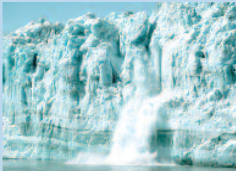
Ice calving from Hubbard Glacier.

A renowned, beautiful Inside Passage city-borough (self-governing community) built on Baranof Island, Sitka is laden with the art and history of its Russian, American and native Alaskan past. It was originally settled by the native Tlingit people, but by the late 1790s, Russian fur traders had become permanent settlers. During optional excursions, you can choose to explore the native artifacts in the National Historical Park and an impressive collection of gold and silver icons in St. Michael's Russian Orthodox Cathedral, or visit the Raptor Rehabilitation Center, Alaska's foremost bald eagle habitat, where more than 100 injured eagles recuperate and are released back into the wild each year.